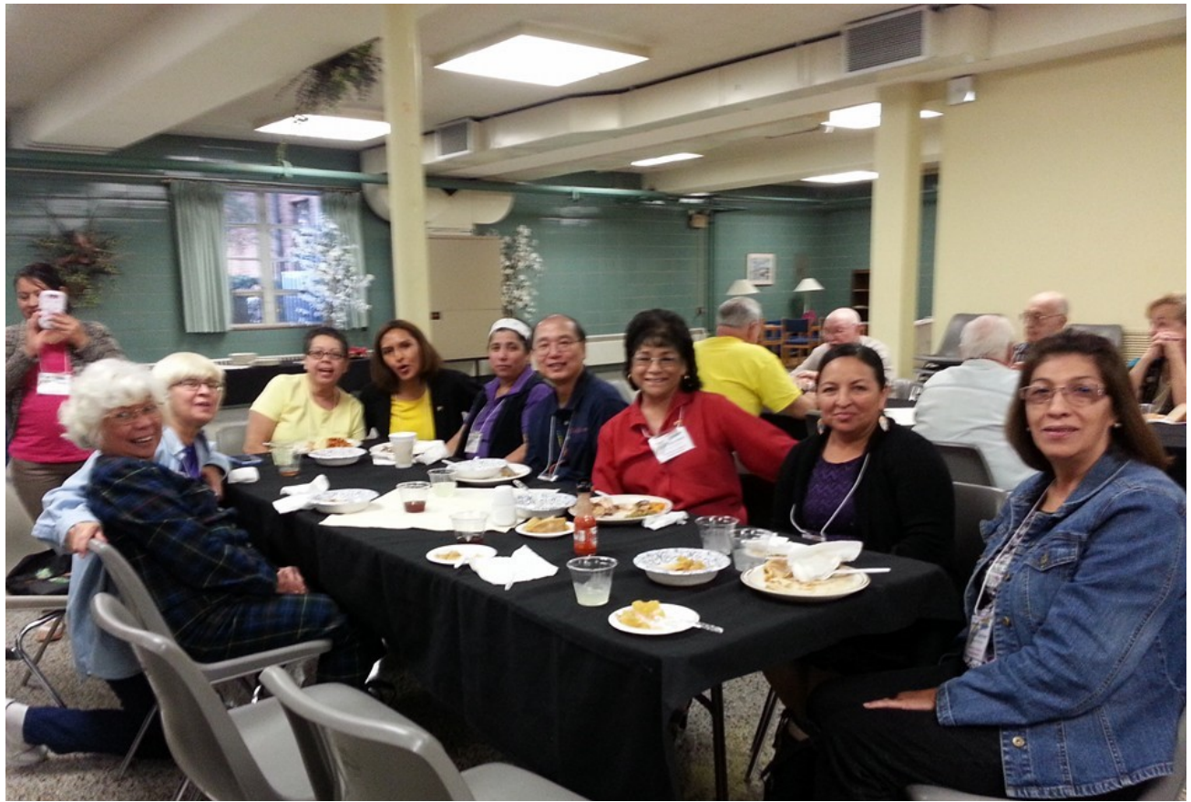
2015 Region IV Fall Encounter Louisville Kentucky, Oct. 9-11, 2015