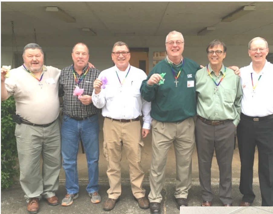
Men's weekend Closing March 25, 2019