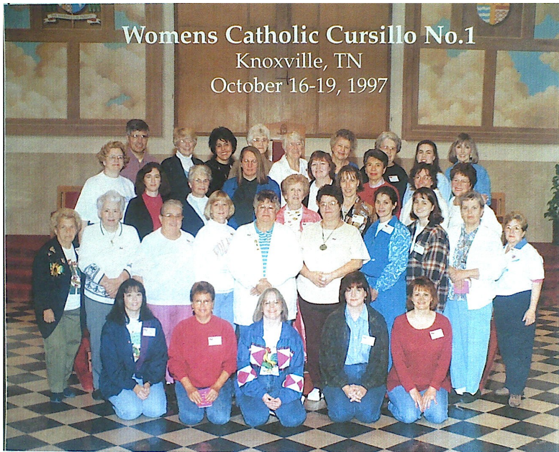
Womens Catholic Cursillo No.1 Knoxville, TN October 16-19, 1997