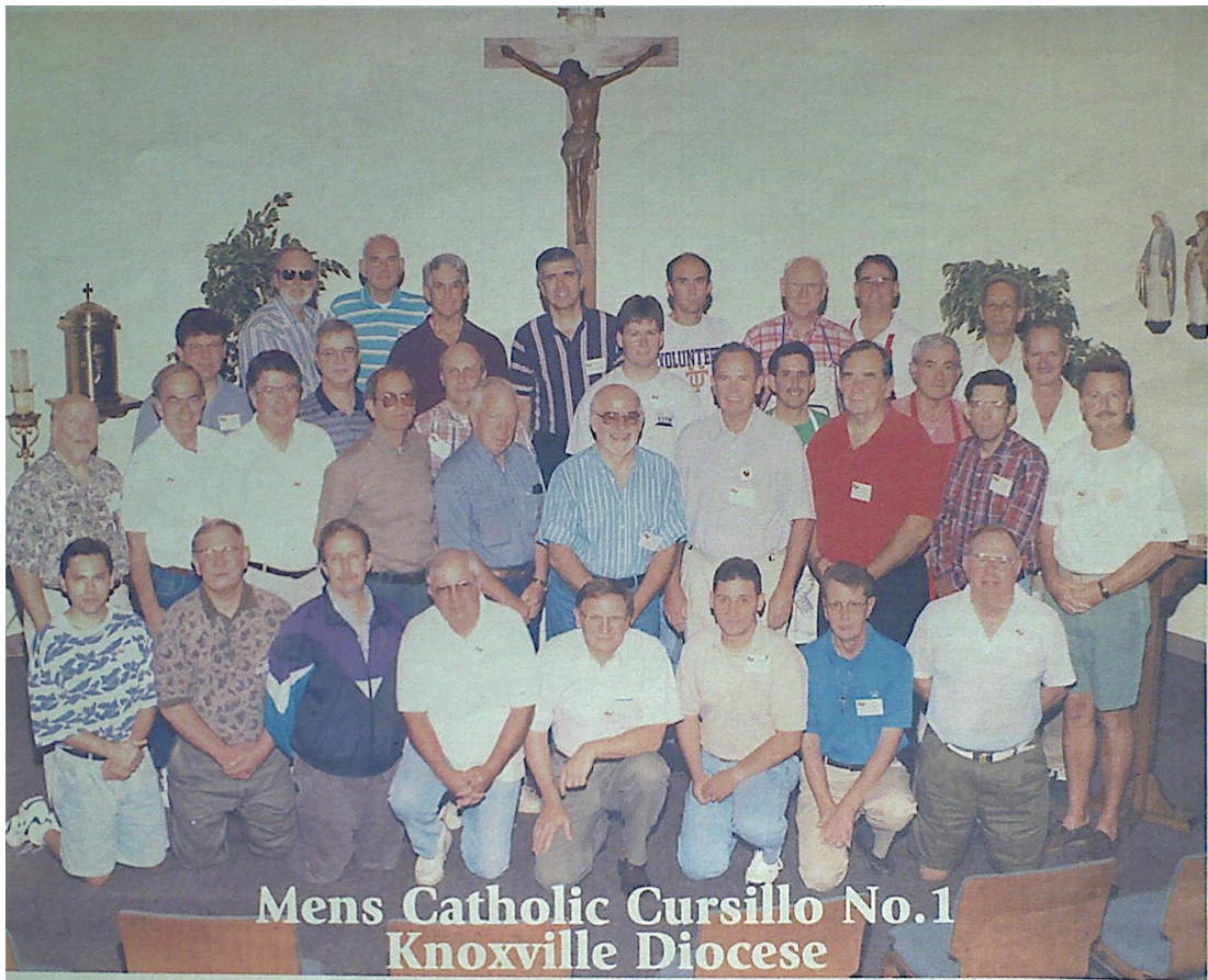
Mens Catholic Cursillo No.1 Knoxville Diocese