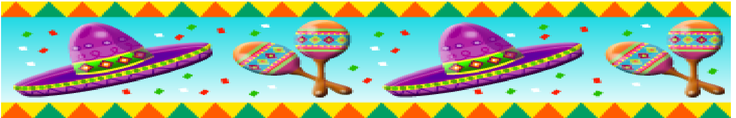
Women's Spanish Cursillo #1